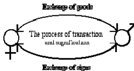
Figure 1: Interaction between two agents.

This means that culture becomes an abstraction that can support our interpretations of economic, political and social practice (from now on referred to as social practice), but it also means that social scientists are confronting a problem of observation. In the first place we have a problem of observation because an intersubjective system of meaning turns out as an abstraction which characterize invisible relations (Bærenholdt 1991). In the second place we can be confronted with a problem of observation because an intersubjective system of meaning can be embedded in systems of meaning that are unknown to the researcher (Collin 1985, Wadel 1991). Thirdly, we have a problem of observation because social practice becomes embedded in the tacit part of culture expressed by Bourdieu as 'the universe of the undiscussed a (1977) and by Giddens as 'unconscious a and 'practical consciousness a (1979).