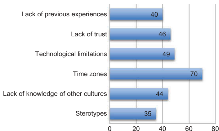
FIGURE 3 Perceptions of Limitations to Carrying Out a Successful Virtual Team Project (Indicated by Number of Students; N = 143 ).