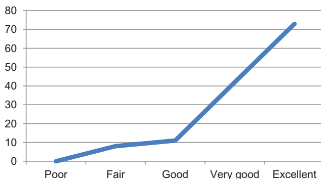
FIGURE 2 Perceptions Regarding Contribution of the GEE's Contest to IB-Related Competences ( N = 143 ).

good” or “excellent” the GEE’s contribution to developing their global mindset and cross-cultural competence.